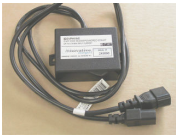
← Mains Leads 1m Long (adjustable on request)