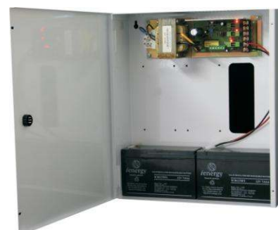
SL 12/2.5S & SL 24/1.5S