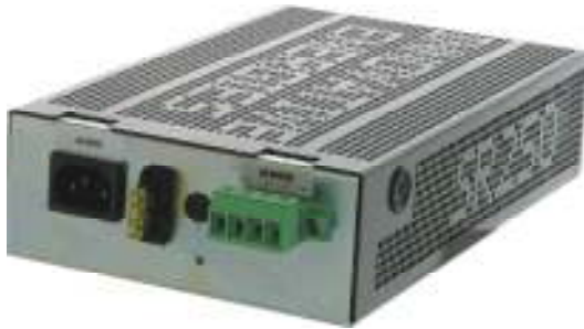
Float Charger for lead acid batteries