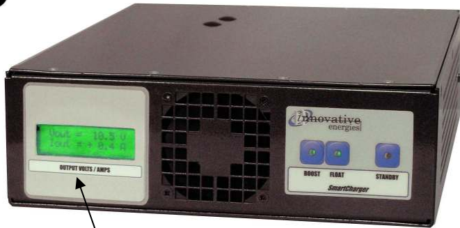
Optional V/I meter shown