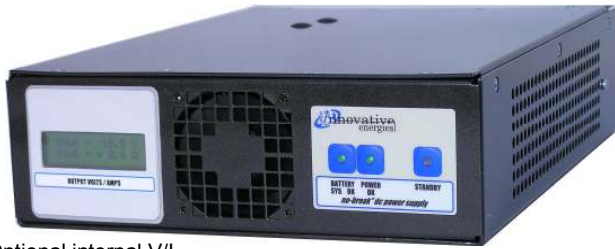
Optional internal V/I meter shown

Battery condition test function available