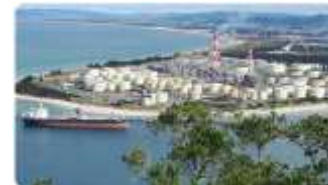
Marsden Point Refinery—Whangarei

These charging systems are used to supply battery backed 30 Volt DC power to the trip coils of 11kV and 3.3kV circuit breakers and the protection relays within the many electrical substations local to the oil refinery. The refinery supplies all of New Zealand's jet fuel, nearly 80% of its diesel and around half of all petrol produced in New Zealand. Also included within each unit were battery condition test and low voltage disconnect functionality, ensuring that the backup power supplies are always ready to go when needed.